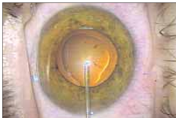
Figure 1. Soft-shell technique. After first injecting the dispersive OVD (Viscoat), the cohesive OVD (Provisc), is injected over the convex anterior capsule. This step pushes the dispersive OVD into the cornea and against the inner incision wall.

Lacking sufficient circumferential tension, a capsule that is not taut will also exhibit elastic behavior. As the surgeon pulls on the anterior capsular flap, the peripheral capsule should be immobile if he is to control the precise direction of the tear. This situation occurs if the zonules are intact, but weak zonules give rise to a condition that I call capsular pseudoelasticity , 4,5 where the anterior capsule is of normal