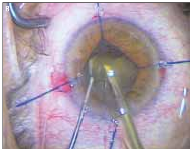
Figure 2. The author places reusable 4–0 polypropylene iris retractors (Katena Products, Inc.) in a diamond configuration, as described by Oetting and Omphroy 4 (A). A subincisional retractor pulls the iris down and away from the phaco tip while maximizing surgical exposure (B).

Ophthalmics, Inc.) to disposable 6–0 nylon retractors (available from Alcon Laboratories, Inc., Fort Worth, TX). At 0.15mm in diameter, the 4–0 retractors are the same size and stiffness as the polypropylene haptic of an IOL. The added stiffness and rigidity, when compared with 6–0 nylon retractors, make 4–0 retractors more durable and easier to manipulate. The 4–0 polypropylene hooks can be autoclaved repeatedly, which makes them more cost effective than their disposable counterparts.