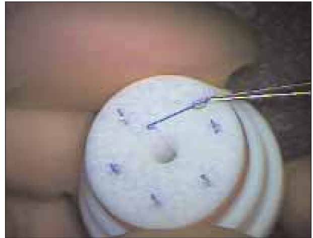
Figure 4. Sterilizing case for reusable iris retractors.

Like pupil expansion rings, iris retractors are much easier to insert prior to the initiation of the capsulorhexis. If the pupil dilates poorly in a patient taking tamsulosin, one should anticipate severe IFIS and consider using