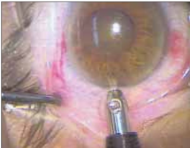
Figure 1. The author makes a separate limbal stab incision just behind the temporal clear corneal incision.

with IFIS. 2,3 Its maximally cohesive properties are ideal for viscomydriasis and for blocking iris prolapse. To prevent the OVD's premature aspiration, lower flow and vacuum rates (eg, < 26mL/min and < 175 to 200mmHg) are recommended. Even then, supplemental re-injections become necessary as the OVD is eventually aspirated. There is a learning curve for mastering the unique viscoadaptive properties of Healon 5, and this IFIS strategy is less suitable if high vacuum settings are needed for a dense nucleus.