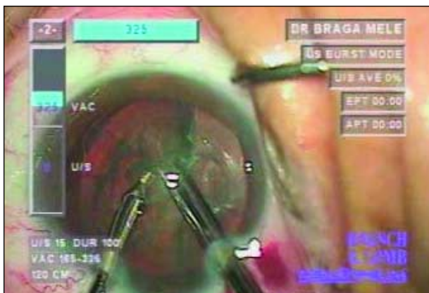
Figure 1. The author demonstrates phaco parameters and vacuum levels using the phaco chop technique.

Phacoburst mode is ideal for phaco chop techniques because it decreases the cavitation energy around the phaco tip and thereby promotes less chatter, essentially creating more effective cutting and better followability (Figure 1). Newer power modulations with the addition of Custom Control Software (Bausch & Lomb) with microburst mode technology, hyperpulse technology, and variable duty cycle capabilities on the Millennium have led to refinements that further lower the total