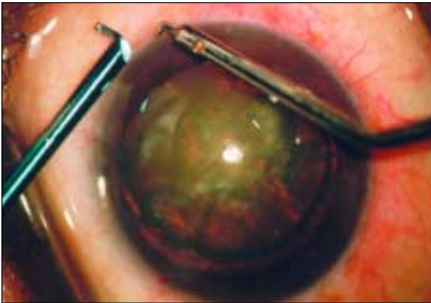
Figure 2. Well-designed irrigating choppers replaced the original bent needle. The Agarwal Irrigation Nucleus Chopper at left has an opening at its end for fluid, whereas that at right has two openings on its sides (both products from Geuder AG, Heidelberg, Germany).

surized fluid for anterior segment surgery. We use the device for all our phaco cases, not only phakonit procedures, and we no longer need an anterior chamber maintainer.