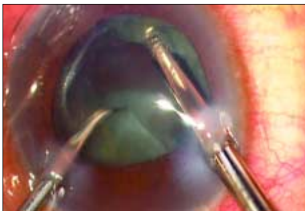
Figure 1. The author performs his first phakonit procedure with a needle bent like a chopper.

My first case involved a dense cataract. I removed the infusion sleeve from the phaco handpiece and connected a 20-gauge needle to the irrigation bottle. I made the incision with a microvitreoretinal blade. Because the incision was small, not much fluid escaped from the eye. I carefully avoided injecting excessive fluid during hydrodissection.